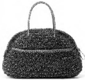
"LAMPO*R" Small Size Boston Bag

A new addition to the zippered Wirebag line, the "LAMPO*R", smaller size of the Boston bag, is chic and functional and great for everyday use. This compact, yet spacious, Boston bag fits all your daily essentials, while keeping a sophisticated look. In addition to a convenient front zipper pocket, it also features inside zipper and open pockets. Woven by sparkle wire code and satin ribbon, it is a lightweight and an ideal daily bag!