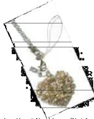
Exclusive Heart Necklace (Not for Sale) Color: White or Silver-Gold