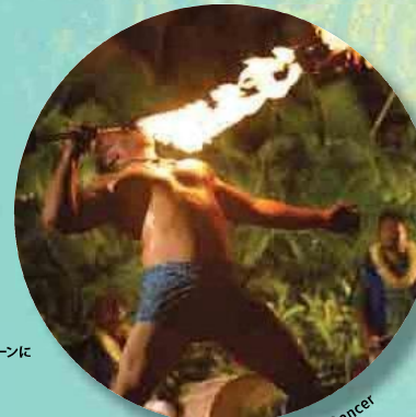
Hawaiian Fire Dancer