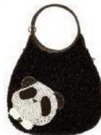
"ANIMALE" Panda Wirebag line Grezzo Opaco ($848), Nero Opaco* ($848) W14 4/7 x H14 4/7 in

* Nero Opaco will be available in January 2013.