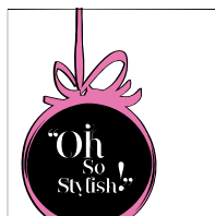
Santa Claus at DFS

December 15 – January 8 / 5 pm – 10 pm, 1 st Floor Lobby