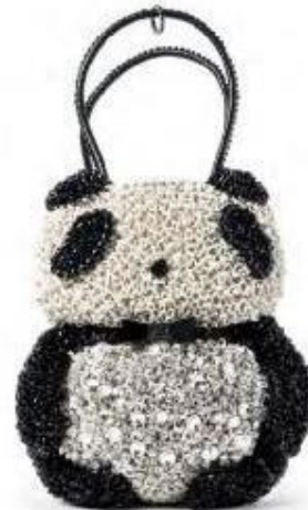
"ANIMALE" Panda Wirebag line 3-D Panda Grezzo Opaco ($923) W10 5/8 x H12 3/5 in

"ANIMALE" line features the friendly and cheerful Panda Wirebag. With the charming and amusing panda shaped Wirebag, women of all ages can enjoy the perfect balance between glamour and joy. Offered in two styles, the 3-D Panda Wirebag, and the Panda Motif Wirebag, this ANIMALE line is sure to be a conversation starter. The 3-D Panda Wirebag is accented with rhinestones throughout the body and comes in a casually chic gray hue. The Panda Motif Wirebag is highlighted with rhinestones and is offered in gray, and will be available in black in January 2013.