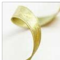
Holiday Gift Wrapping