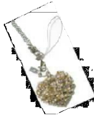
Exclusive Heart Necklace (Not for Sale) Color: White or Silver-Gold