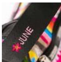
LeSportsac Embroidery Service

January 1 / 8 am - Midnight, All Floors (While supplies last.)